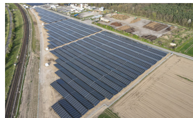
Bruhrain, Germany Capacity: 6.166 kWp Commissioning: 04/2022