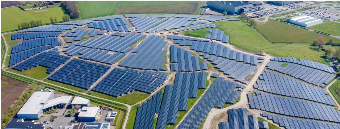
Bavelse Berg, Netherlands Capacity: 37.000 kWp Commissioning: 03/2021

From 6 MWp photovoltaic systems to large-scale projects with more than 100 MWp, we are your contact for professional implementation and support.