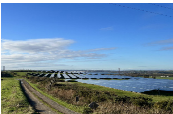
Lurrig, Ireland Capacity: 5.2 MWp Commissioning: 06/2022