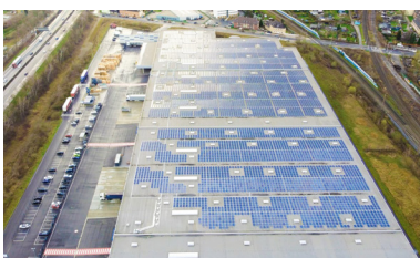
Logicor Gelsenkirchen, Germany Capacity: 745 kWp Commissioning: 03/2022