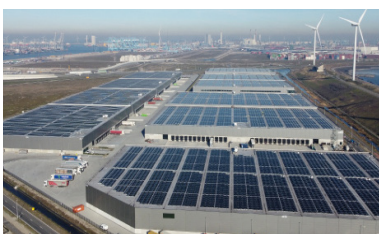
Smartlog Maasvlakte, Netherlands Capacity: 25 MWp Commissioning: 05/2022

GOLDBECK SOLAR is your flat roof specialist.