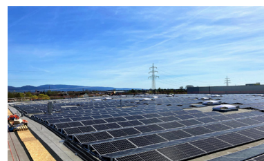
Rheinenergie, Germany Capacity: 3.750 kWp Commissioning: 03/2022