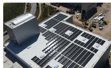
Greiwing Worms, Germany Capacity 675 kWp Commissioning: 11/2022