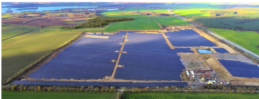
Zietlitz, Mecklenburg-Vorpommern Power: 76.600 kWp Start of operation: 12/2020

Photovoltaic systems from 750 kWp to utility scale projects with more than 100 MWp, we are your contact for professional implementation and support.