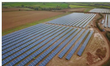
Creacombe, Great Britain Power: 7.292 kWp Start of operation: 12/2019