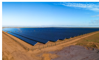
Akadyr, Kazakhstan Power: 50.000 kWp Start of operation: 07/2019