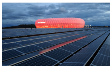
Allianz Arena, Germany Power: 834 kWp Start of operation: 12/2019

Based on our wide experience in industrial construction, we know all aspects that need to be considered for a solar roof. GOLDBECK SOLAR is your specialist for flat roofs.