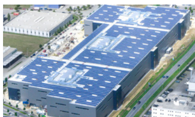
Hugo Boss, Metzingen Power: 985 kWp Start of operation: 08/2008