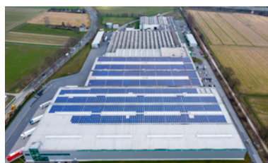
Klingele, Werne Power: 1.500 kWp Start of operation: 03/2020