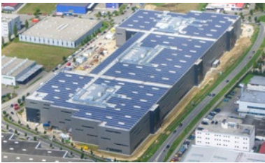
Hugo Boss, Germany Power: 985 kWp Start of operation: 08/2008