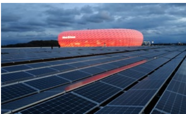
Allianz Arena, Germany Power: 834 kWp Start of operation: 12/2019

Based on our wide experience in industrial construction, we know all aspects that need to be considered for a solar roof. GOLDBECK SOLAR is your specialist for flat roofs.