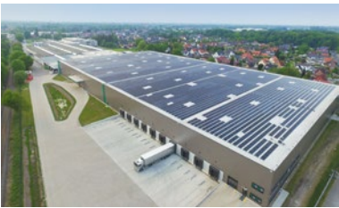
Klingele, Germany Power: 1.559 kWp Start of operation: 04/2016