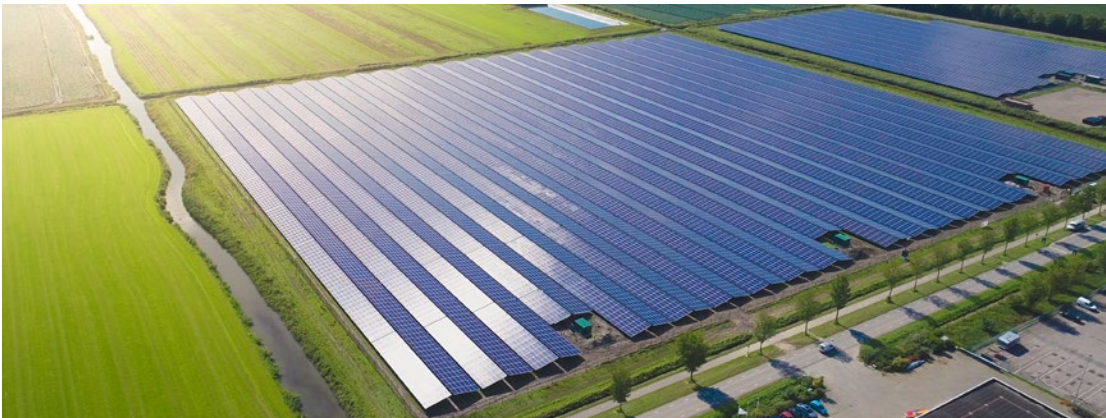
Andijk, Netherlands Power: 15.000 kWp Start of operation: 10/2018

Photovoltaic systems from 750 kWp to utility scale projects with more than 100 MWp, we are your contact for professional implementation and support.