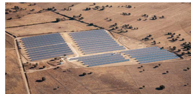
AES, Villamesías Spain

Power: 5,771 kWp Start of operation: 08/2008 Inverters: Conergy Modules: Conergy, Solar Fabrik, Yingli