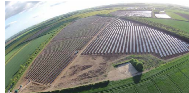
Branston Solar Park, Branston Great Britain

Power: 2,004 kWp Start of operation: 04/2012 Inverters: SolarMax Modules: Canadian Solar