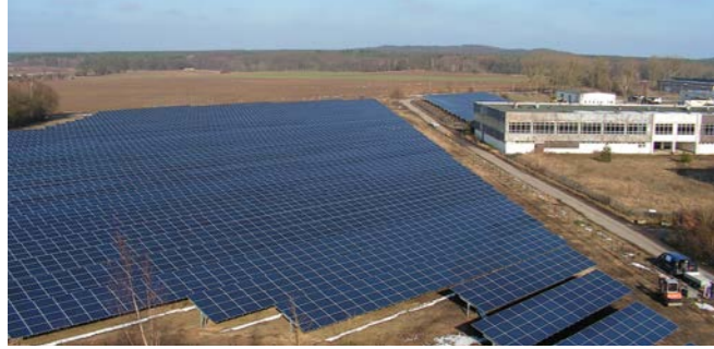
Athos, Britz Germany

Power: 8,220 kWp Start of operation: 02/2013 Inverters: Sungrow Modules: Canadian Solar