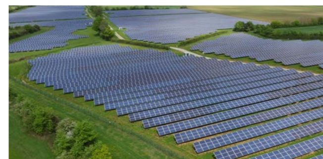
Eneco, Sevor Great Britain

Power: 10,685 kWp Start of operation: 03/2014 Inverters: ABB Modules: REC