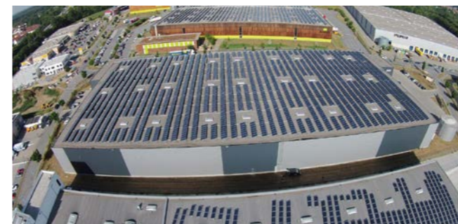
Alnatura, Lorsch Germany

Power: 1.947 kWp Start of operation: 04/2010 Inverters: SolarMax Modules: Yingli