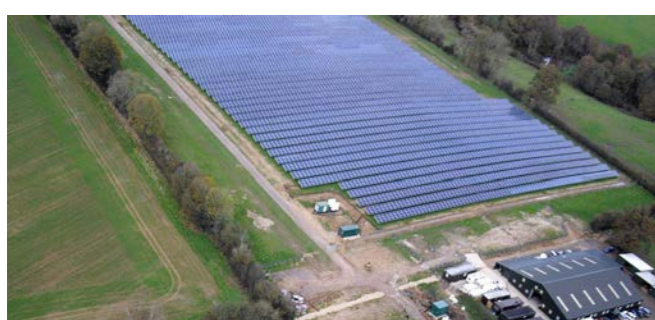
Oxford Capital, Redbridge Great Britain

Power: 6,540 kWp Start of operation: 03/2013 Inverters: SMA Modules: Canadian Solar