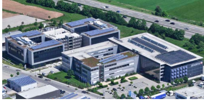
Goldbeck, Hirschberg Germany

Power: 64 kWp Start of operation: 09/2013 Inverters: Sputnik, REFU Modules: Yingli