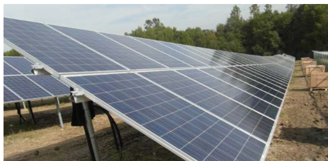
Landfill, Außernzell Germany

Power: 4,562 kWp Start of operation: 07/2012 Inverters: SolarMax Modules: ReneSola