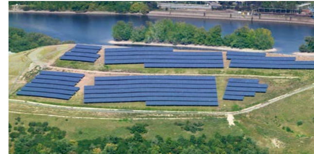
Landfill, Mannheim Germany

Power: 2,072 kWp Start of operation: 12/2010 Inverters: SMA Modules: Yingli