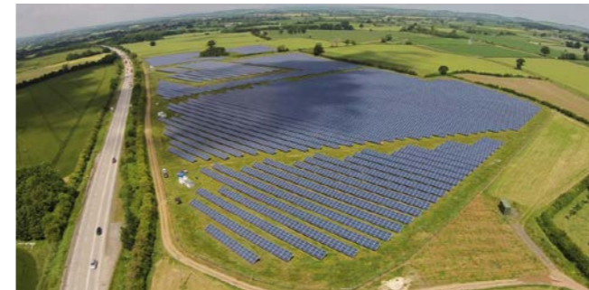
Adiant, Dillington Great Britain

Power: 6,410 kWp Start of operation: 03/2014 Inverters: ABB Modules: Yingli