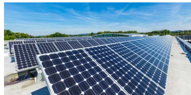
Goldbeck, Bielefeld Germany

Power: 60 kWp Start of operation: 08/2009 Inverters: REFUsol Modules: Yingli