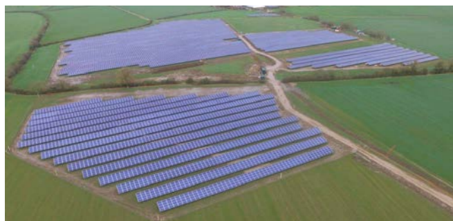
Green Nation, White Lake Great Britain

Power: 13,104 kWp Start of operation: 03/2015 Inverters: SMA Modules: REC