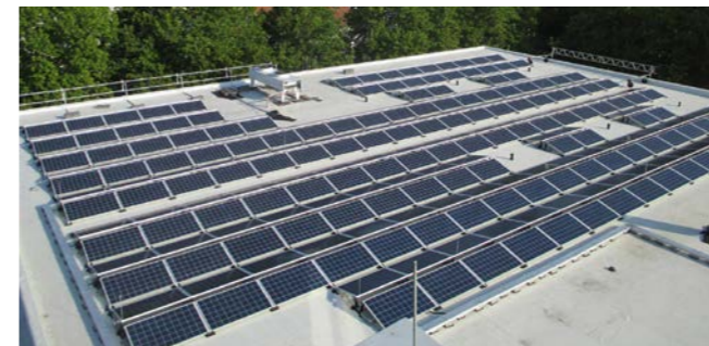
BÄKO, Ladenburg Germany

Power: 1,622 kWp Start of operation: 05/2016 Inverters: Sungrow Modules: Canadian Solar