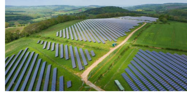
Green Nation, Coleford Great Britain

Power: 7,257 kWp Start of operation: 03/2014 Inverters: ABB Modules: Yingli