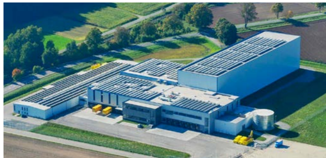
RTP Autoteile, Pressath Germany

Power: 2.316 kWp Start of operation: 07/2013 Inverters: REFU Modules: Yingli