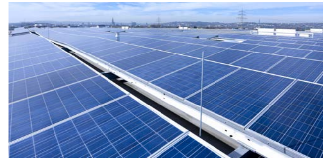
Honold, Neu-Ulm Germany

Power: 219 kWp Start of operation: 12/2010 Inverters: SMA Modules: Yingli