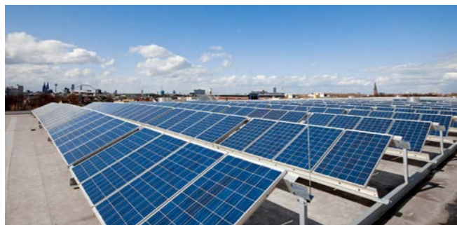
Beeline, Cologne Germany

Power: 320 kWp Start of operation: 12/2007 Inverters: Sputnik Modules: Conergy