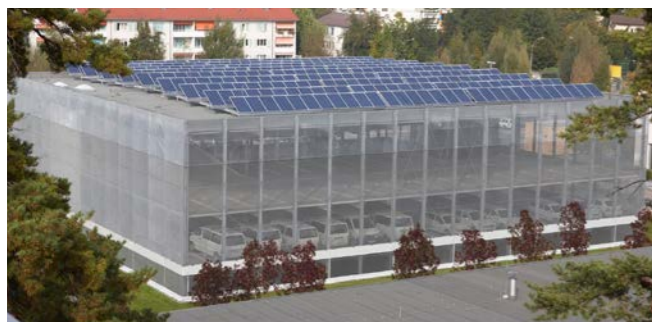
Multi-storey car park VKW, Bregenz Austria

Power: 3,261 kWp Start of operation: 10/2004 Inverters: SMA Modules: Solara