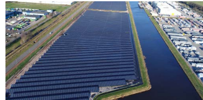
Astronergy, Veendam Netherlands

Power: 15.500 kWp Start of operation: 12/2017 Inverters: Schneider Electric Modules: Astronergy