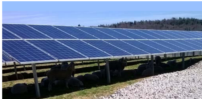
Landfill, Weißer Stein Germany

Power: 8,220 kWp Start of operation: 02/2013 Inverters: Sungrow Modules: Canadian Solar