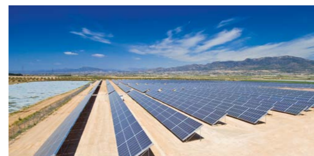
NEEC, Murcia Spain

Power: 2,400 kWp Start of operation: 08/2008 Inverters: Conergy Modules: Conergy, Solar Fabrik, Yingli