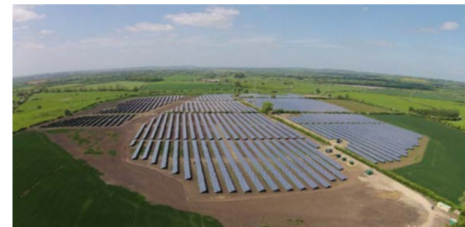
Hazel Capital, Folly Great Britain

Power: 5,522 kWp Start of operation: 12/2015 Inverters: SMA Modules: ReneSola