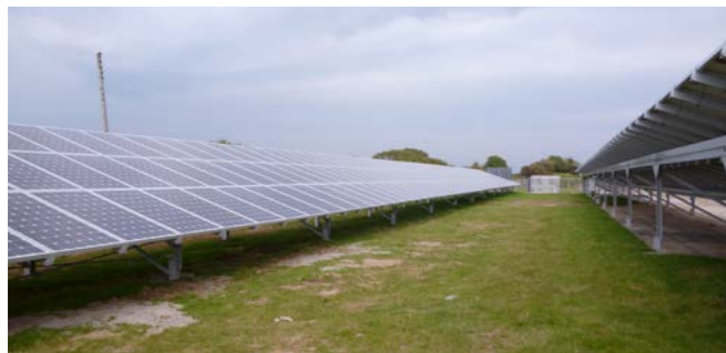
Cenin, Cardiff Great Britain

Power: 1,457 kWp Start of operation: 12/2011 Inverters: REFUsoL Modules: Yingli