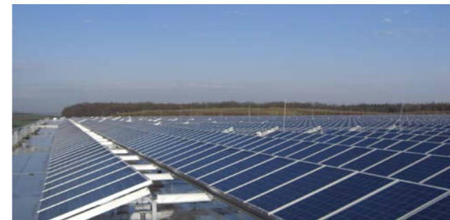
Porsche, Sachsenheim Germany

Power: 1.159 kWp Start of operation: 07/2010 Inverters: SMA Modules: Yingli