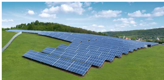
Olovary I + II Slovakia

Power: 735 kWp Start of operation: 07/2011 Inverters: SolarMax Modules: Yingli