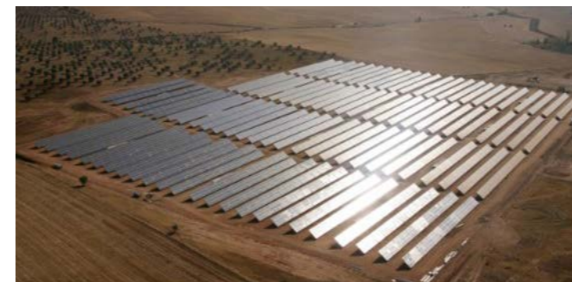
AES, Alvarado Spain

Power: 2,850 kWp Start of operation: 04/2010 Inverters: SolarMax Modules: Yingli