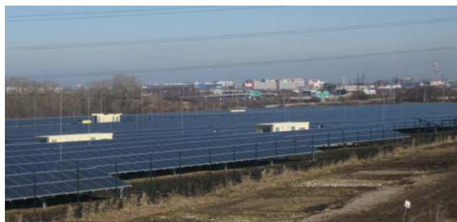
Amesbury, Chrástany Czech Republic

Power: 2 x 996,87 kWp Start of operation: 02/2011 Inverters: Sputnik Modules: Yingli