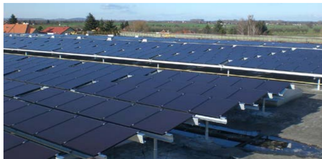
Dolní Bucice, Vrdy Czech Republic

Power: 561 kWp Start of operation: 11/2006 Inverters: SMA Modules: Inowatt