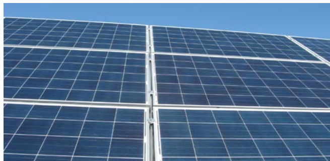
Gülnar, Mersin Turkey

Power: 4,998 kWp Start of operation: 10/2015 Inverters: SMA Modules: REC