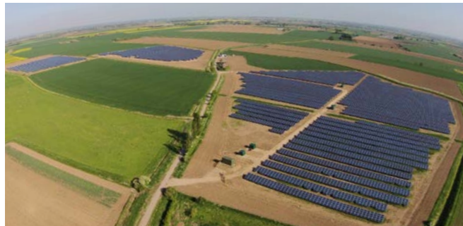
Foresight, Nowhere Great Britain

Power: 9,004 kWp Start of operation: 03/2015 Inverters: Schneider Electric Modules: REC