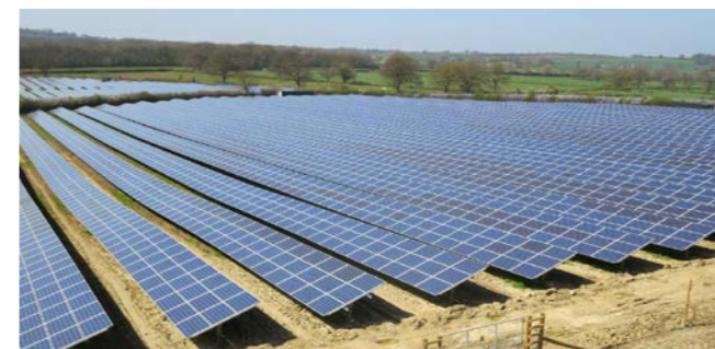
Green Nation, Monksham Great Britain

Power: 10,795 kWp Start of operation: 03/2014 Inverters: ABB Modules: REC