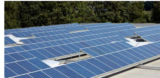
Alatex, Emsdetten Germany

Power: 671 kWp Start of operation: 01/2011 Inverters: Sputnik Modules: Yingli