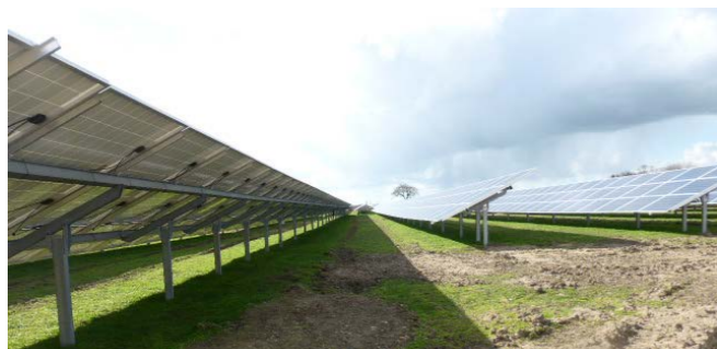
Aurum, Reydon Great Britain

Power: 7,020 kWp Start of operation: 07/2013 Inverters: SMA Modules: Canadian Solar