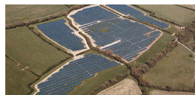
Hazel, Jordanstown Great Britain

Power: 4,330 kWp Start of operation: 03/2014 Inverters: SMA Modules: Yingli