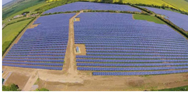
Emberton Solar Park LTD, Great Britain

Power: 9,004 kWp Start of operation: 03/2015 Inverters: Schneider Electric Modules: REC