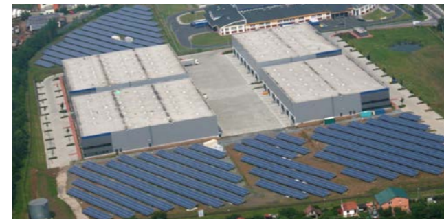
Amesbury, Pilsen Czech Republic

Power: 1,111 kWp Start of operation: 11/2010 Inverters: SolarMax Modules: Yingli