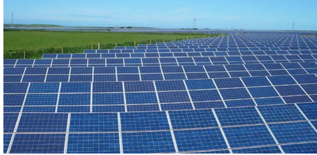
Low Carbon, Hope Great Britain

Power: 7,257 kWp Start of operation: 03/2014 Inverters: ABB Modules: Yingli