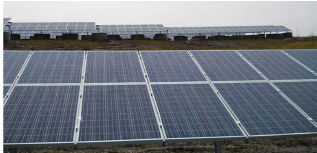
Landfill, Neu-Dietenheim Germany

Power: 1,457 kWp Start of operation: 12/2011 Inverters: REFUsoL Modules: Yingli