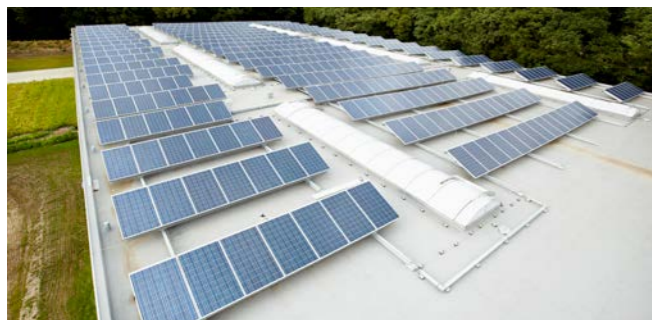
Helmerts, Osnabrück Germany

Power: 120 kWp Start of operation: 03/2010 Inverters: SMA Modules: Yingli