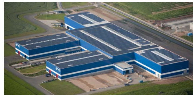
Gonvarri, Erfurt Germany

Power: 380 kWp Start of operation: 12/2009 Inverters: SMA Modules: REC