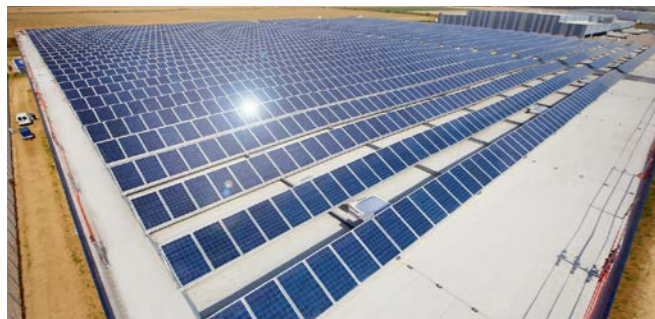
Kerpen Logistikzentrum Germany

Power: 280 kWp Start of operation: 03/2013 Inverters: REFU Modules: Yingli