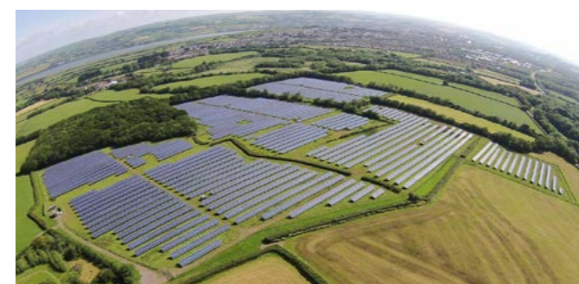
Hazel, Horsacott Great Britain

Power: 4,993 kWp Start of operation: 03/2014 Inverters: ABB Modules: REC