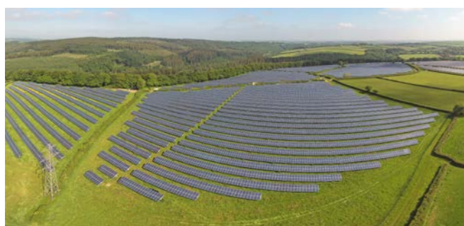
Aurum, Bodmin II Great Britain

Power: 8,340 kWp Start of operation: 03/2013 Inverters: REFUsoL Modules: Yingli