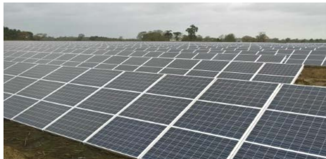
Waterditch, Dorset Great Britain

Power: 4,998 kWp Start of operation: 11/2015 Inverters: SMA Modules: REC