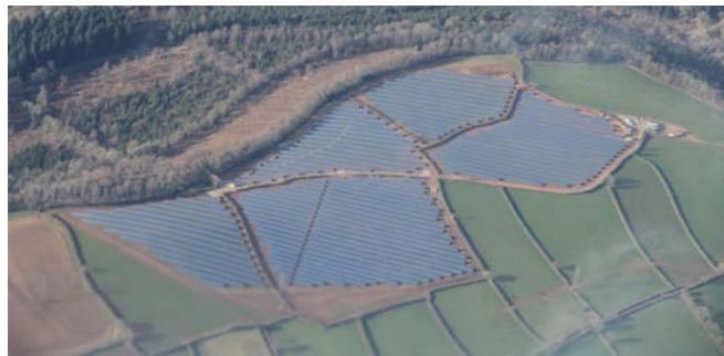
Lower Bodiniel Farm Great Britain

Power: 1,505 kWp Start of operation: 09/2012 Inverters: SolarMax Modules: JA Solar