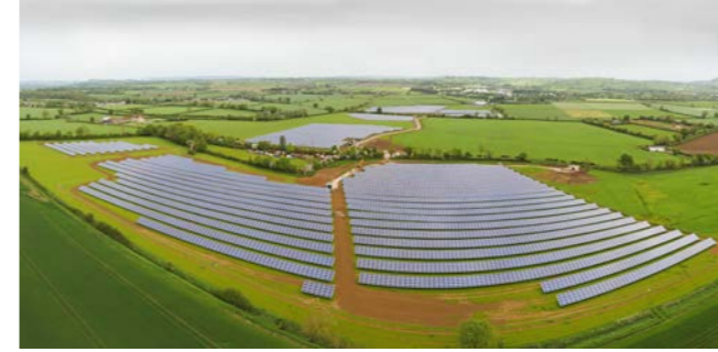
Green Nation, Pylle Great Britain

Power: 4,998 kWp Start of operation: 03/2016 Inverters: SMA Modules: REC