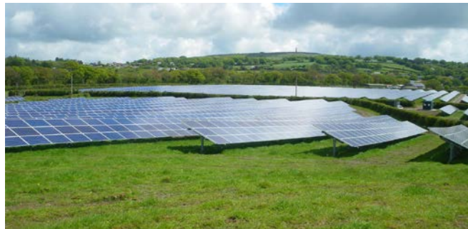
Low Carbon, Callington Great Britain

Power: 3,402 kWp Start of operation: 03/2014 Inverters: ABB Modules: REC