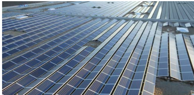
Rudolf, Östringen Germany

Power: 64 kWp Start of operation: 09/2013 Inverters: Sputnik, REFU Modules: Yingli