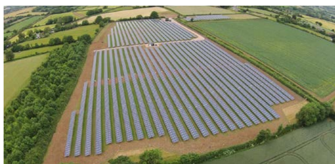
TGC / Foresight, Tengore Lane Great Britain

Power: 3,500 kWp Start of operation: 03/2015 Inverters: SMA Modules: REC