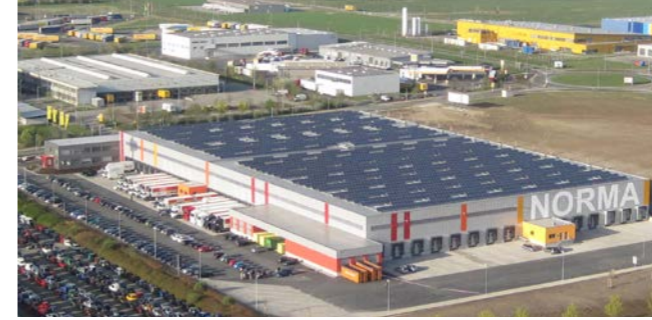
Norma, Erfurt Germany

Power: 992 kWp Start of operation: 09/2011 Inverters: Sputnik Modules: Yingli