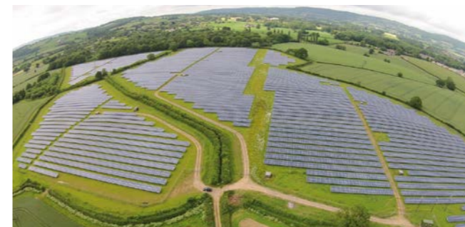
Hazel, Halse Great Britain

Power: 4,993 kWp Start of operation: 03/2014 Inverters: ABB Modules: REC