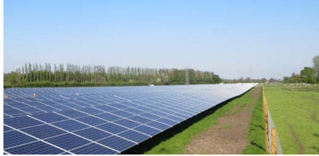
Foresight, Draycott in the Clay Great Britain

Power: 4,998 kWp Start of operation: 03/2016 Inverters: SMA Modules: REC