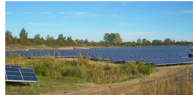
Karstens & Cordes, Kargow Germany

Power: 707 kWp Start of operation: 06/2012 Inverters: REFUSol Modules: Canadian Solar