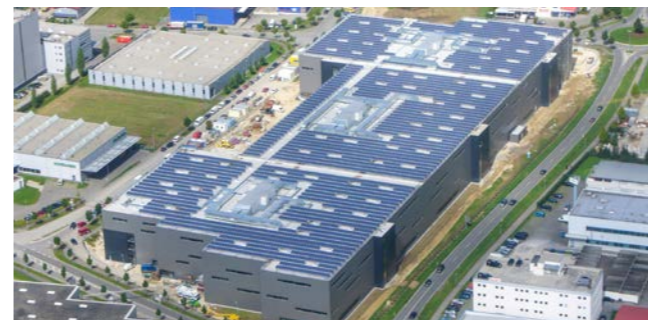
Holy AG, Metzingen Germany

Power: 120 kWp Start of operation: 03/2010 Inverters: SMA Modules: Yingli