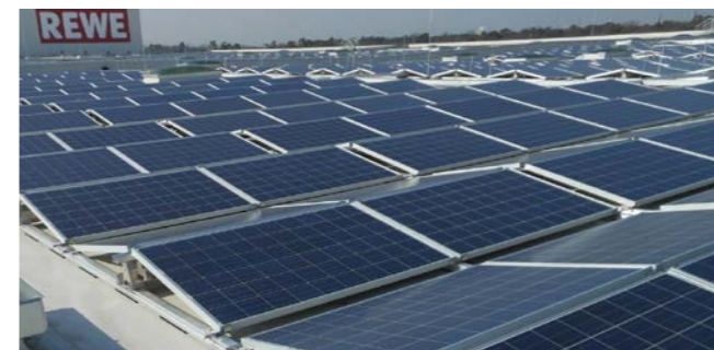
REWE, Neu-Isenburg Germany

Power: 499 kWp Start of operation: 08/2015 Inverters: SMA Modules: ReneSola