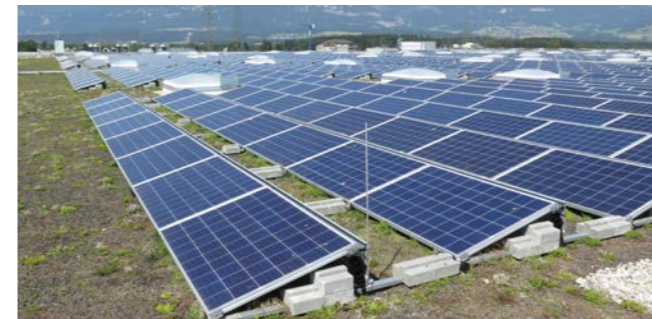
Wissensteinfeld, Derendingen Switzerland

Power: 994 kWp Start of operation: 08/2017 Inverters: SMA Modules: Canadian Solar