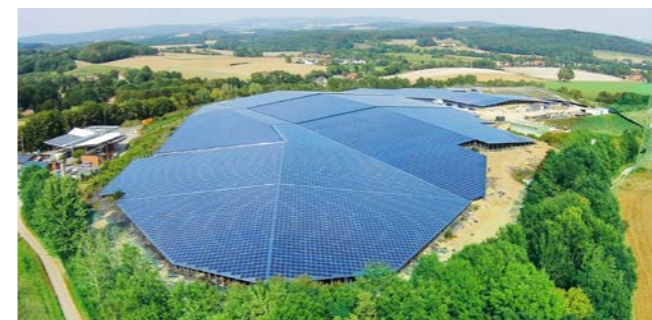
Landfill, Hellsiek Germany

Power: 4.998 kWp Start of operation: 03/2017 Inverters: Schneider Electric Modules: Canadian Solar