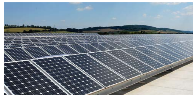
Käppler & Pausch, Neukirch Germany

Power: 468 kWp Start of operation: 12/2009 Inverters: SMA Modules: Yingli