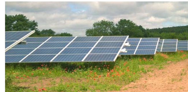
Foresight Group, Mansfield Great Britain

Power: 15.500 kWp Start of operation: 12/2017 Inverters: Schneider Electric Modules: Astronergy