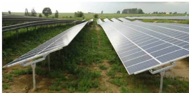
Aurum, Ketzerbachtal Germany

Power: 4,972 kWp Start of operation: 07/2012 Inverters: SolarMax Modules: Canadian Solar