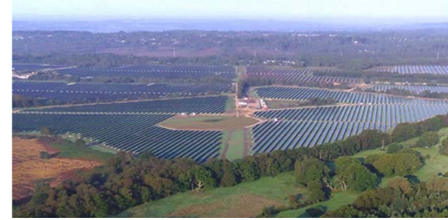
Adiant, Bournemouth Great Britain

Power: 3,619 kWp Start of operation: 03/2015 Inverters: SMA Modules: REC