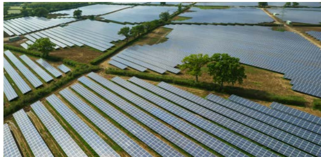
Foresight, Melksham Great Britain

Power: 4,998 kWp Start of operation: 11/2015 Inverters: SMA Modules: REC