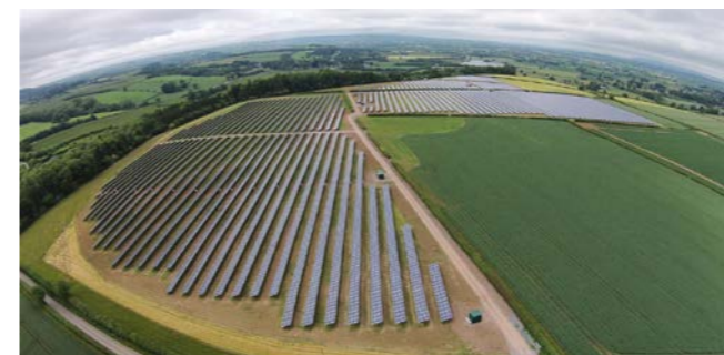
Foresight, Hurcott Great Britain

Power: 4,998 kWp Start of operation: 11/2015 Inverters: SMA Modules: REC