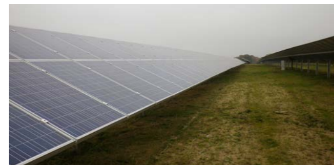
Athos, Vollersode Germany

Power: 2,500 kWp Start of operation: 03/2012 Inverters: REFUSol Modules: Canadian Solar