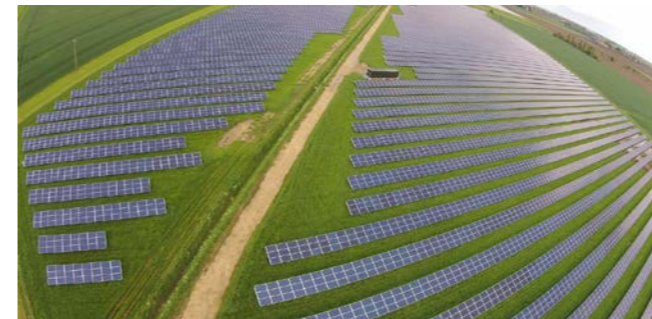
Hazel Capital, Wrangle Great Britain

Power: 20,930 kWp Start of operation: 03/2014 Inverters: SMA Modules: REC