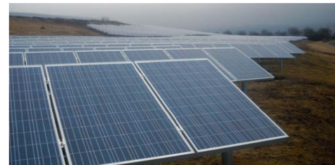
Landfill, Bad Salzungen Germany

Power: 18,882 kWp Start of operation: 03/2012 Inverters: SMA Modules: REC