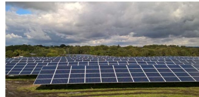
Eneco, Oakland Plantation Great Britain

Power: 3,589 kWp Start of operation: 12/2015 Inverters: Schneider Electric Modules: REC