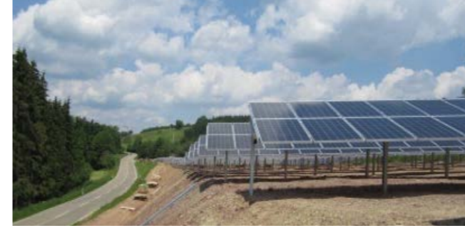
LCA SOLAR, Glatten Germany

Power: 1,228 kWp Start of operation: 07/2012 Inverters: SolarMax Modules: Canadian Solar