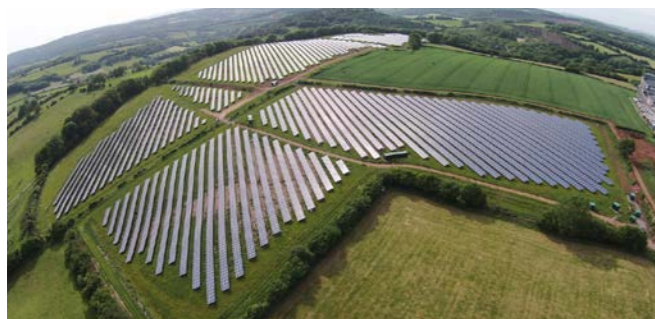
Green Nation, Milkwall Great Britain

Power: 8,304 kWp Start of operation: 03/2015 Inverters: SMA Modules: ReneSola