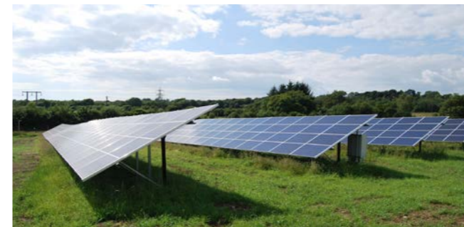
Good Energy, Llangyfelach Great Britain

Power: 4.998 kWp Start of operation: 03/2017 Inverters: SMA Modules: Canadian Solar