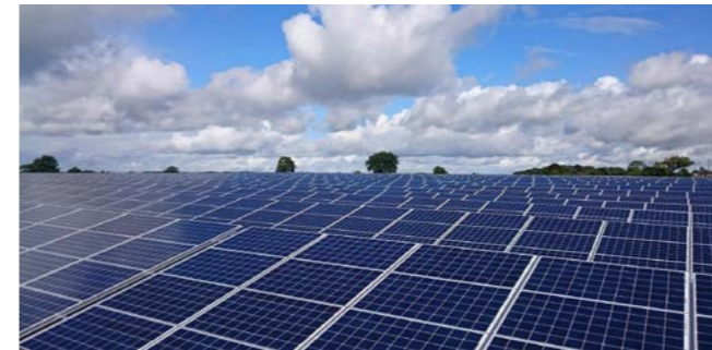
Foresight, Upper Huntingford Great Britain

Power: 49,649 kWp Start of operation: 03/2016 Inverters: S-Energy Modules: Canadian Solar