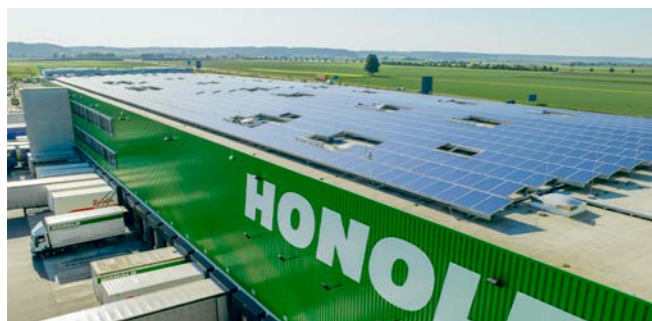
Honold, Augsburg Germany

Power: 985 kWp Start of operation: 08/2008 Inverters: REFUsol Modules: REC