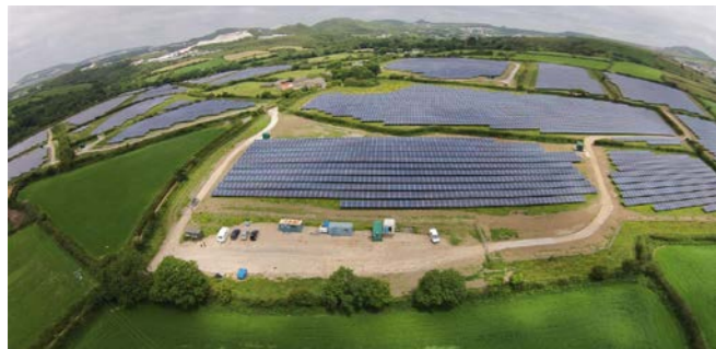
Good Energy, Carloggas Great Britain

Power: 8,121 kWp Start of operation: 03/2015 Inverters: SMA Modules: ReneSola