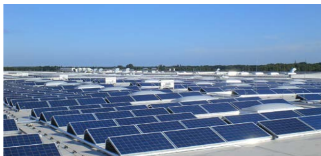
REWE, Oranienburg Germany

Power: 248 Start of operation: 12/2012 Inverters: REFU Modules: ReneSola