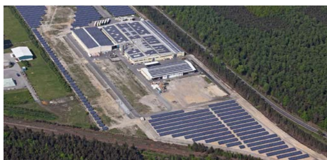
Rygol, Lauta Germany

Power: 4,700 kWp Start of operation: 12/2010 Inverters: SolarMax Modules: Eging